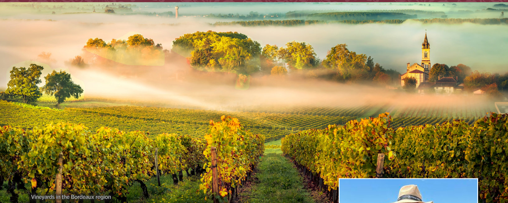
Vineyards in the Bordeaux region

Uncork local traditions, savor intense flavors and enjoy palate-pleasing adventures during an AmaWaterways Wine Cruise